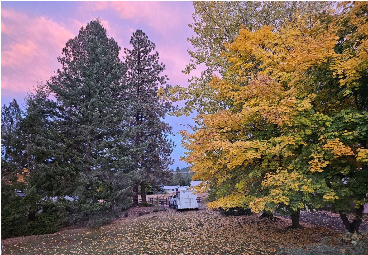
Leaves falling at Bea Christopherson's place.